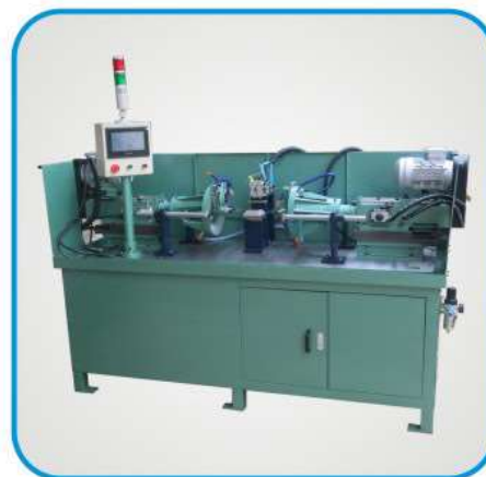
2 sides multi spindles automatic drilling machine 两头多轴自动钻孔机