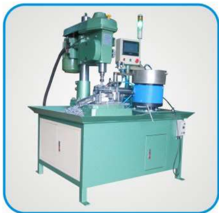
Automatic single nut tapping machine 全自动单轴螺母攻牙机