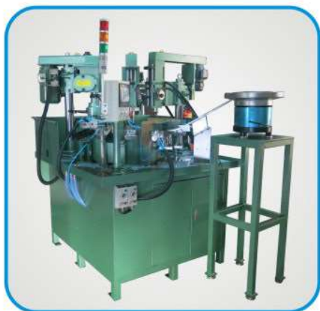
Automatic disc drilling, countersunk and tapping machine 全自动钻孔倒角攻牙机