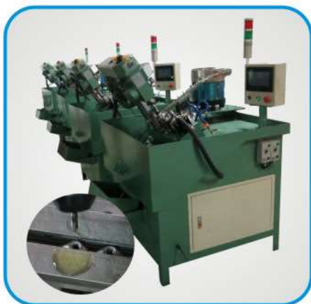
Automatic inclined single tapping machine 全自动斜式单轴攻牙机