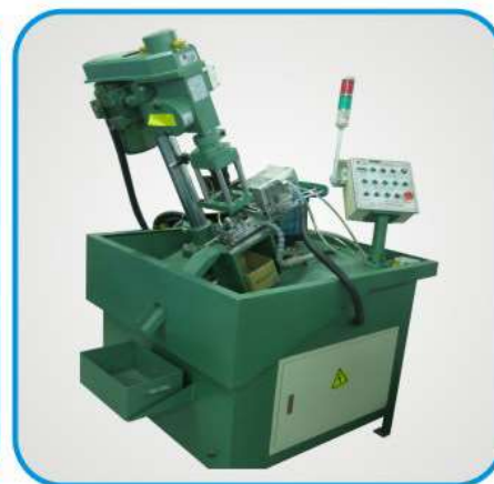
Automatic inclined 2 spindles tapping machine 全自动斜式双轴攻牙机