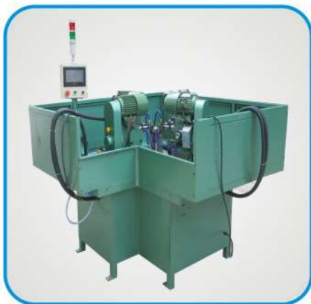
4 sides automatic single tapping machine 四面单轴自动攻牙机