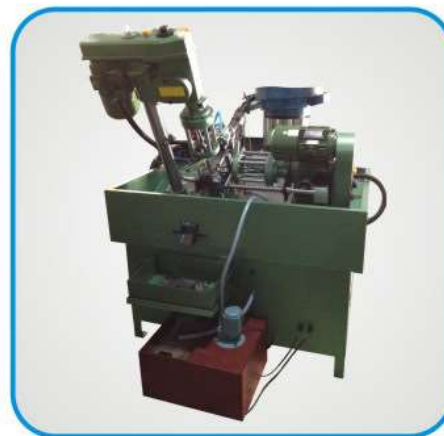
Automatic vertical and horizontal multi spindles tapping machine 全自动立卧多轴攻牙机