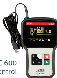
TLC 600 Remote control