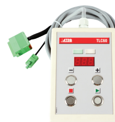
TLC 60 Remote control