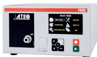
F620 leak tester