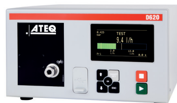
D620 Flow tester