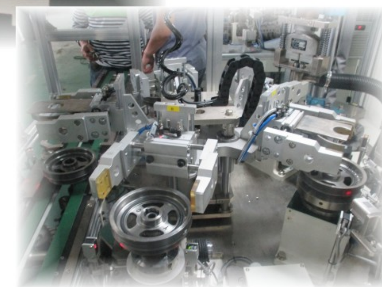
扭转减震器平衡机 Balancing machine for Torsion damper