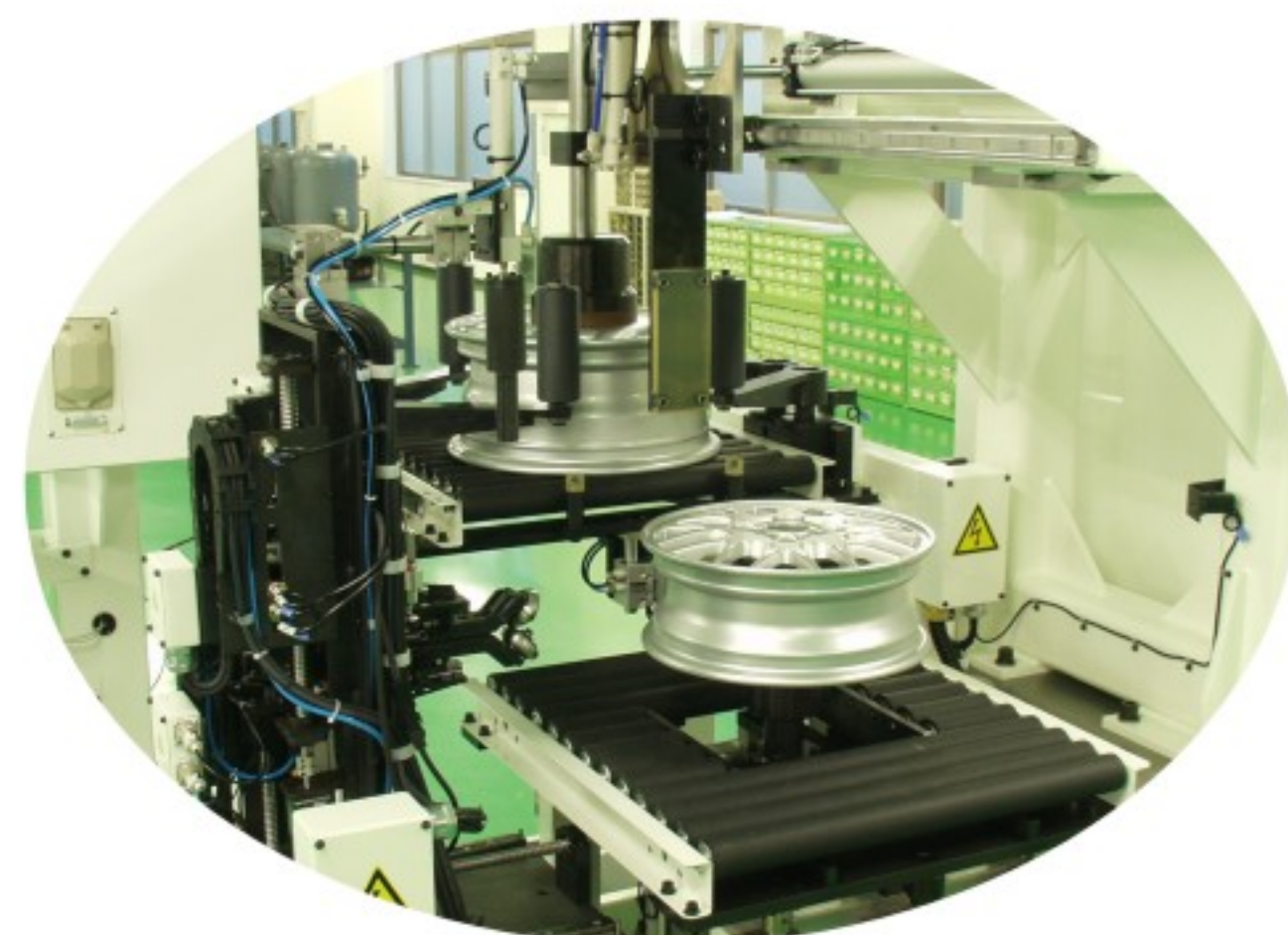
轮辋平衡机 Balancing Machine for rim felloe felly