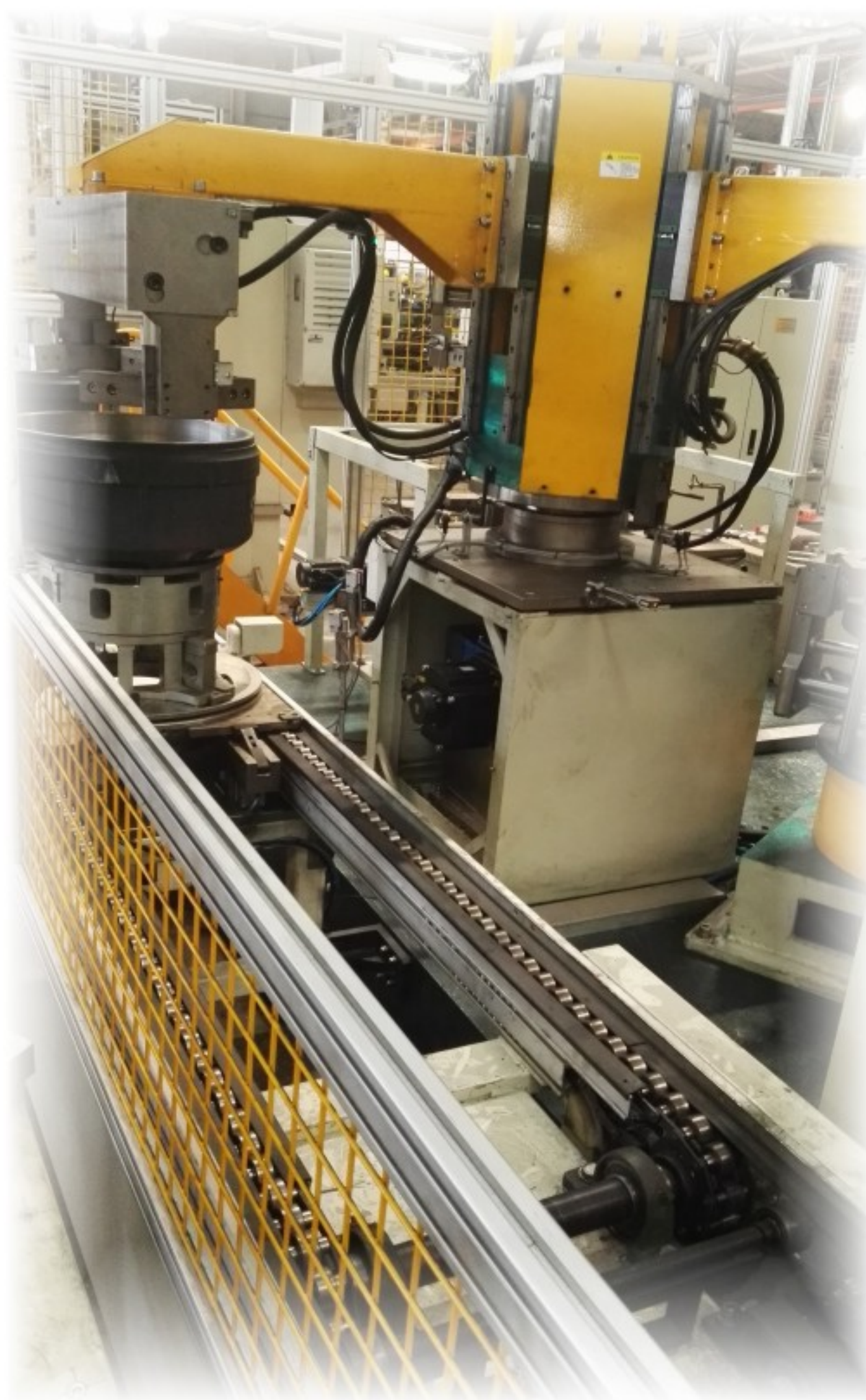
轮毂平衡机 Wheel hub balancing machine