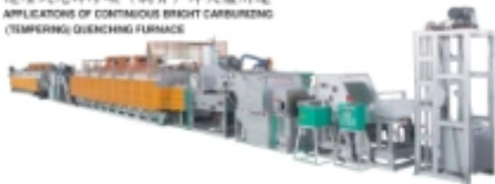
連續式淬火爐具載運機架示意圖 THE CONTINUOUS HARDENING QUENCHING FURNACE RUNNING BEAM LAMP