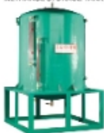
SY-803 甲醇儲存槽 METHANOL STORAGE TANK