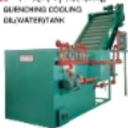
SY-806 淬火冷卻溝(水)槽 QUENCHING COOLING GUL(WATER)TANK