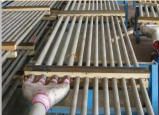
Ethylene cracking furnace tube