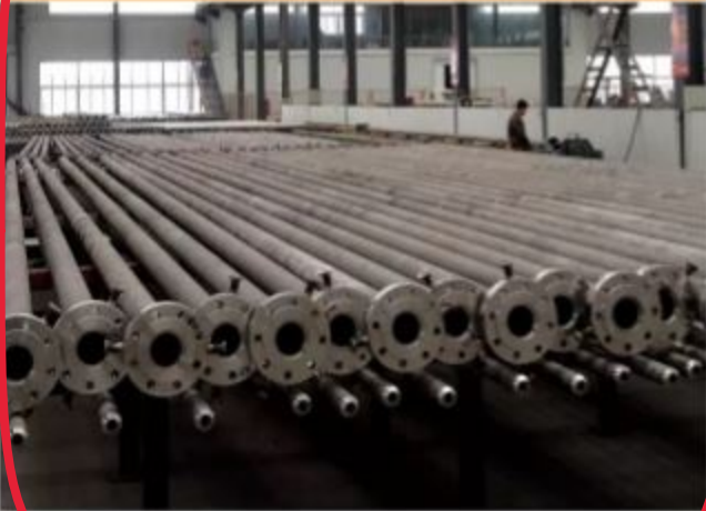
Catalyst reformer tube