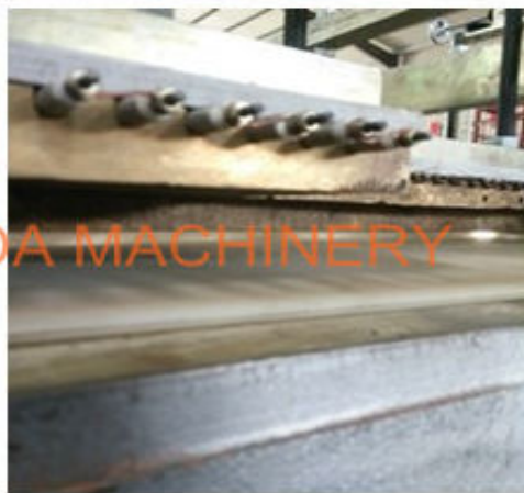
Common shape long sleeve glove making machine: