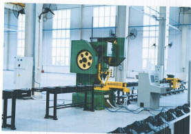
Semiautomatic CNC Punching Machine for Angles Model AP16A-8