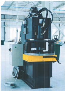
Hydraulic Notching Machine for Angles Model ACH200