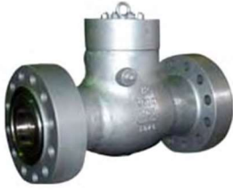
Monel check valve

ADD: No.30 Zhanghe Road, Yijiang District, Wuhu City, Anhui Province, China