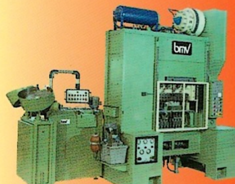
T2V/25/12/70 - page 49