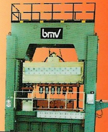
T1/160/9/350/560 - page 28