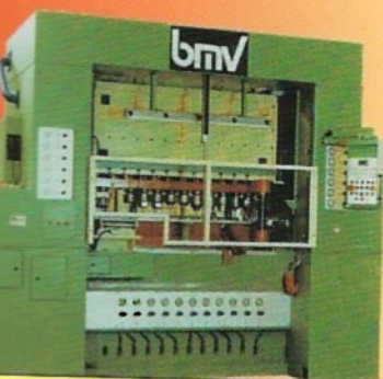
T4/100/12/150/150 - page 31