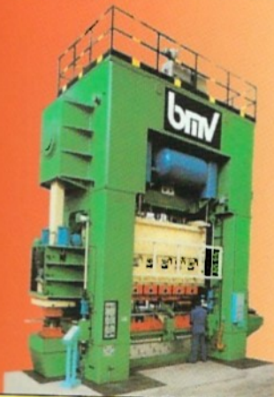
T1/E/1000/5+1/500/400 - page 8 - 9