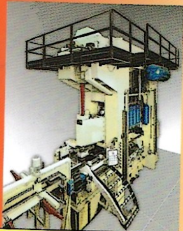
T1/TE/160/8+1/350/630 - page 29-30