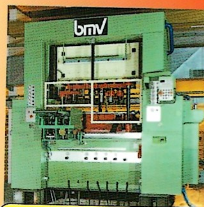
T4/125/7/230/380 - page 25