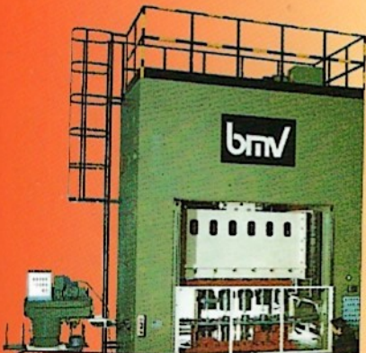
T1/200/6/300/320 - page 45