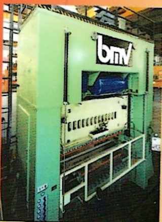
T1/600/15/200/350 - page 14-15