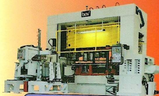
T4/160/9/325/360 - page 76