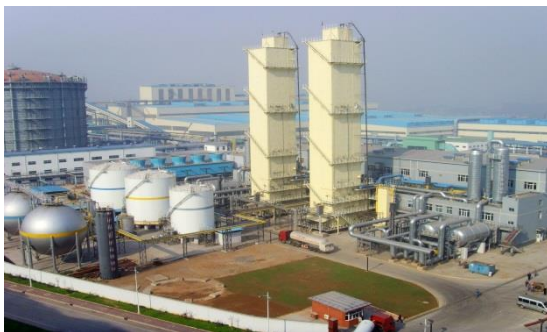
2*23500Nm 3 , Tianjin Steel