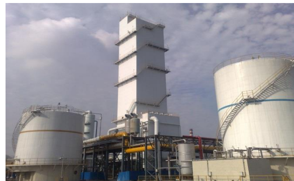
39000Nm 3 ASP, Jiangyinxingcheng Steel