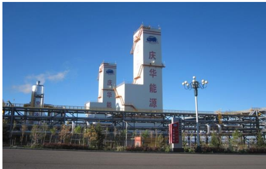
2*55000Nm 3 , Xinjiang Qinhua Project