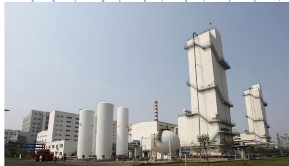
40000Nm 3 ASP, Xinao, Inner Mongolia