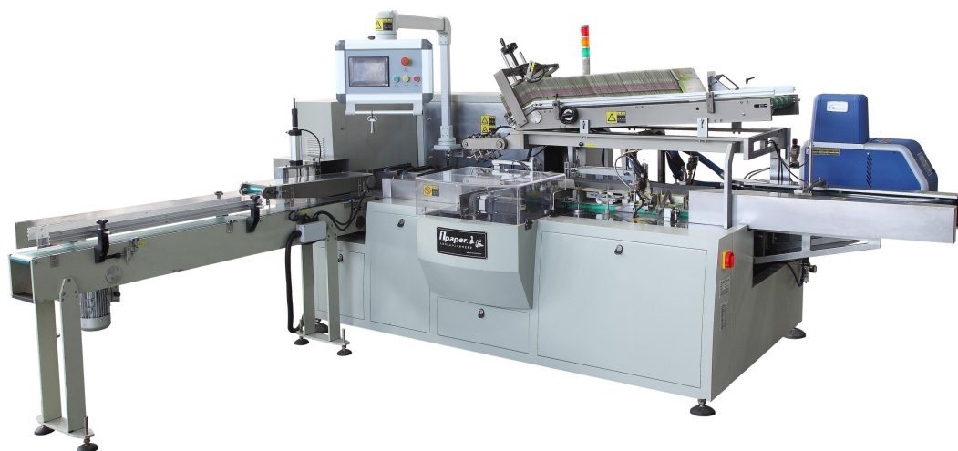
PICTURE2:Automatic Facial Tissue Boxing And Sealing Machine OPH-100B