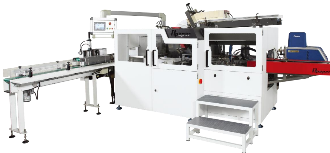
PICTURE1: OPH-120B high-speed automatic facial tissue box-in and box-sealing machine (Rotary type)