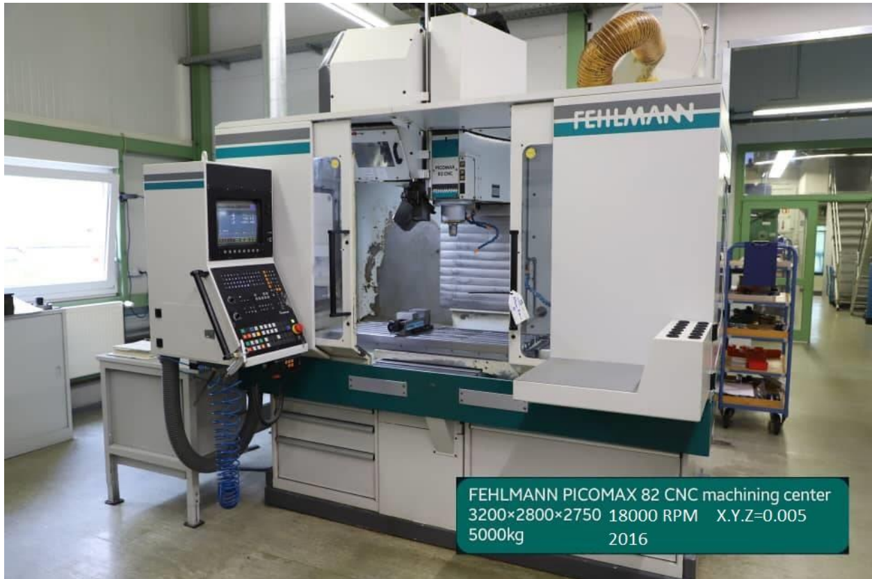
FEHLMANN PICOMAX 82 CNC machining center 3200×2800×2750 18000 RPM X.Y.Z=0.005 5000kg 2016