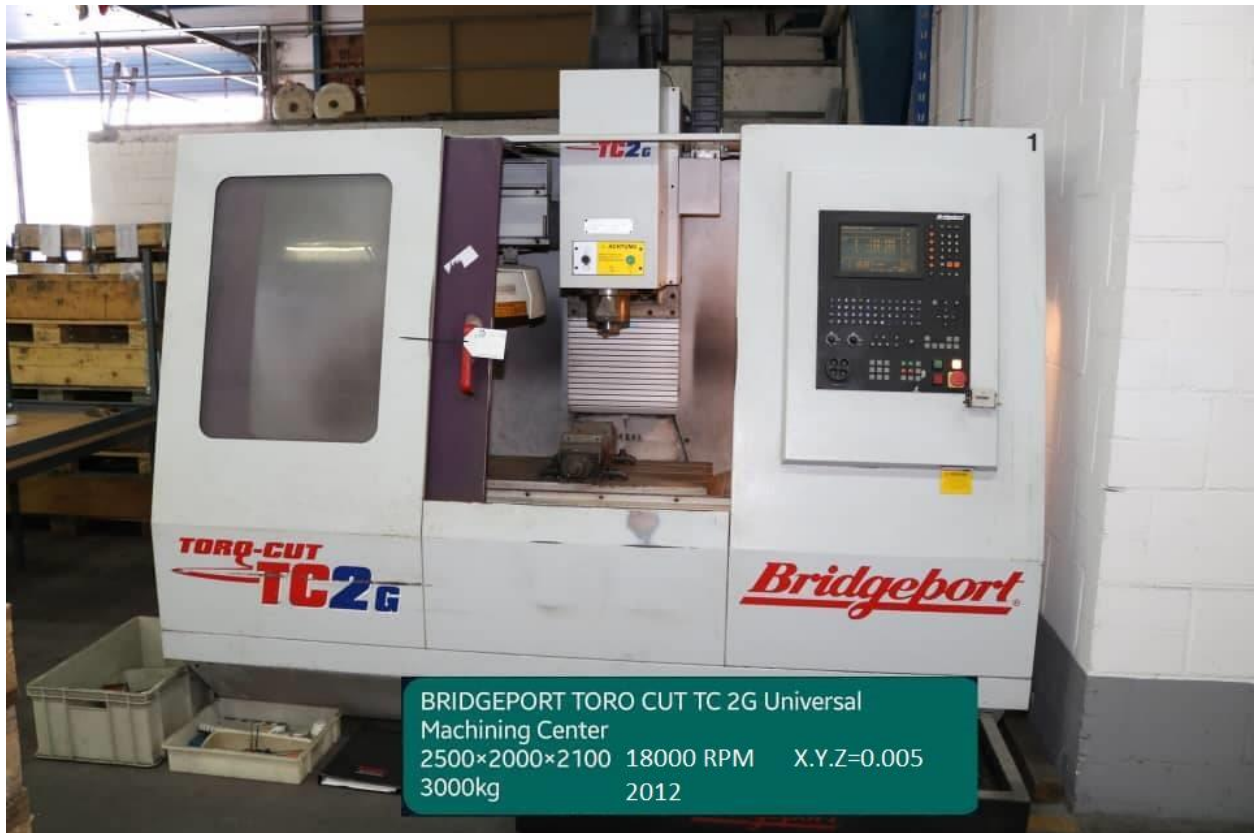
BRIDGEPORT TORO CUT TC 2G Universal Machining Center 2500×2000×2100 18000 RPM X.Y.Z=0.005 3000kg 2012