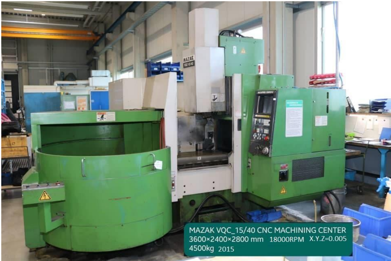
MAZAK VQC_15/40 CNC MACHINING CENTER 3600×2400×2800 mm 18000RPM X.Y.Z=0.005 4500kg 2015